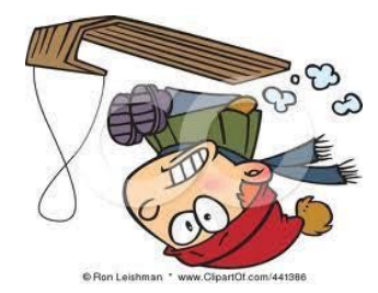
A FATHER / DAUGHTER EVENT

HOT CHOCOLATE AND DONUTS WILL BE SERVED !!!